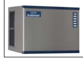
T304不锈钢面板 T304 Stainless Steel Panels