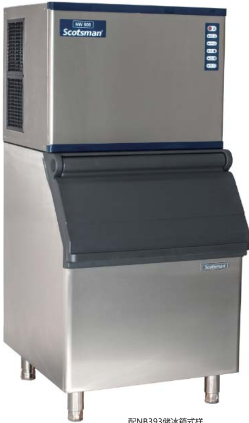
配NB393储冰箱式样 Shown on NB393 bin