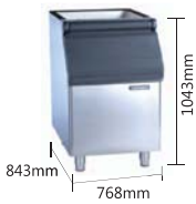
储冰量: 178kg Storage Capacity: 178kg