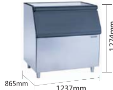
储冰量: 406kg Storage Capacity: 406kg