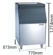
储冰量: 243kg Storage Capacity: 243kg