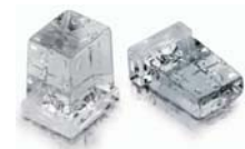
方冰 - 12克 Dice Cube - 12g (26.5 x 26.5 x 26 mm) 半方冰 - 6克 Half Dice Cube - 6g (13 x 26.5 x 26 mm)