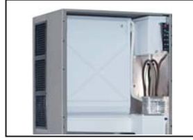
垂直蒸发器制冰系统 Vertical Cube System