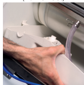
Easy to remove water sump