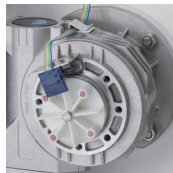
Gear box protection (hall effect)