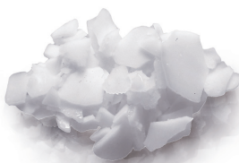
Residual water content 2%

Ice scales are the coldest form of ice. Formed at -6° to -12°Celsius, they are very dry, containing less than 2% residual water. Scales look like fragments of glass, have an irregular shape and a thickness that can be adjusted at 1 or 2 mm.