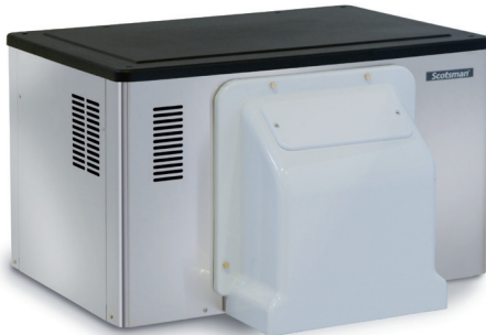
ABS Ice Chute Cover: sold separately.