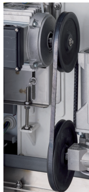
Pulleys & belt system allows to modify ice thickness