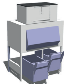
MAR 208+ITS2250 (sold separately)