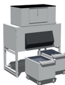
MAR 208+SIS1350 (sold separately)