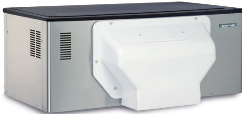
ABS Ice Chute Cover: sold separately.