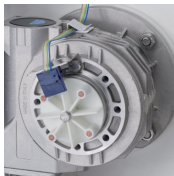
Gear box protection (hall effect)