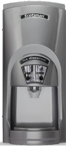
TC S-L 180 AS