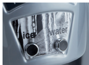
TC S-L 180 ASM

Manual version with 2 push buttons - Ice & water configuration - Easy clean