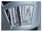
TC S 180 EVO

Touch free dispensing model - Ice only configuration - No push buttons in the front - Easy clean - Specific for self-service use