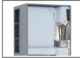
垂直蒸发器制冰系统 Vertical Cube System