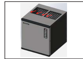
可顶部出风 (背进侧出为标配, 背进顶出为选配) Top Air flow (Back side in ; Left side out for standard and top side out for option)