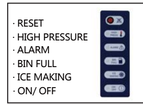
自动报警指示灯 Auto-alert Indicator Lights