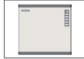
T304不锈钢面板 22英寸宽 T304 Stainless Steel Panels 22 inch width