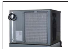
人性化的空气滤网 Proximity Condenser Air Filter