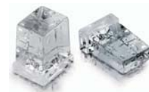
方冰 - 12克 半方冰 - 6克 Dice Cube - 12g Half Dice Cube - 6g (26.5 x 26.5 x 26 mm) (13 x 26.5 x 26 mm)