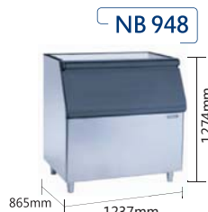
储冰量: 406kg Storage Capacity: 406kg