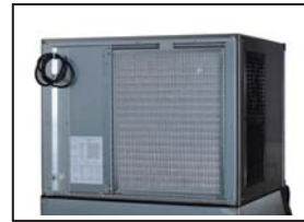
人性化的空气滤网 Proximity Condenser Air Filter