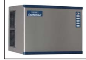
T304不锈钢面板 T304 Stainless Steel Panels