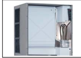
垂直蒸发器制冰系统 Vertical Cube System