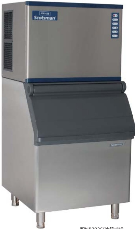
配NB393储冰箱式样 Shown on NB393 bin