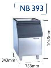
储冰量: 178kg Storage Capacity: 178kg