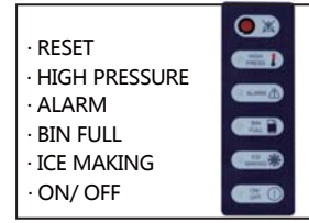
自动报警指示灯 Auto-alert Indicator Lights