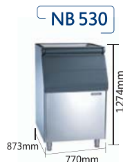
储冰量: 243kg Storage Capacity: 243kg