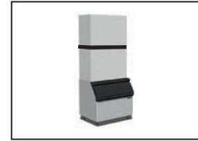
可机头叠加 (装置另购) Double Stack (Needs a stacking kit sold separately)